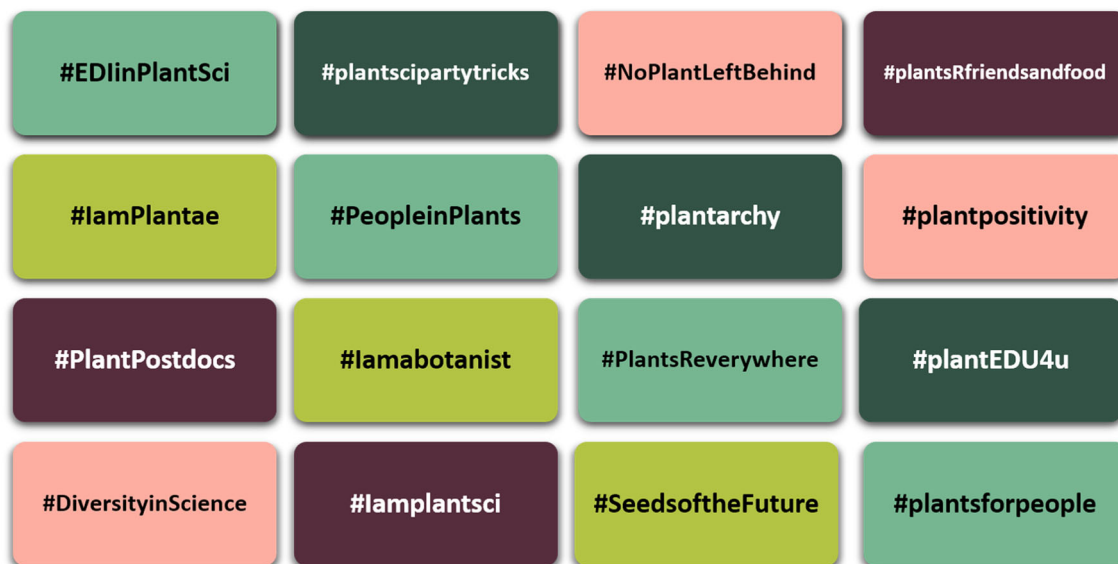
FIGURE 2 Using social media to promote plants and science education. The workshop participants had a crack at developing their own social media hashtags to increase enthusiasm for plants and to increase a feeling of inclusion in science. Here, we display hashtags created by workshop participants. We encourage the use of these hashtags and recommend pairing them with interesting pictures of plants and people. Participants also toyed with designing memes (not shown). There are many plant memes found online such as “Plants have all the anthers” or “Things I do in my spare time: Buy more plants” (Fluellen, 2020) that have viral appeal with the general public and help to increase awareness of plants.

the plant sciences. We are not so much promoting mandatory awareness training, though many institutions already do so, but rather identifying and growing a new generation of diverse leadership: the role models who by dint of their own life experiences, can represent the spearhead of change. Leaders do not simply appear; their potential must be identified and realized. Where institutional leadership is diverse, it is often “assigned” to a diversity portfolio, which is insufficient and risks tokenism. Real change will occur when diverse leaders are not the exception and arise because of their broad qualifications and contributions. In terms of our recommendation here, those qualifications would include skills in science diplomacy and the ability to actively engage in the public debate and policy setting around issues of equity, diversity, and inclusion in STEM.